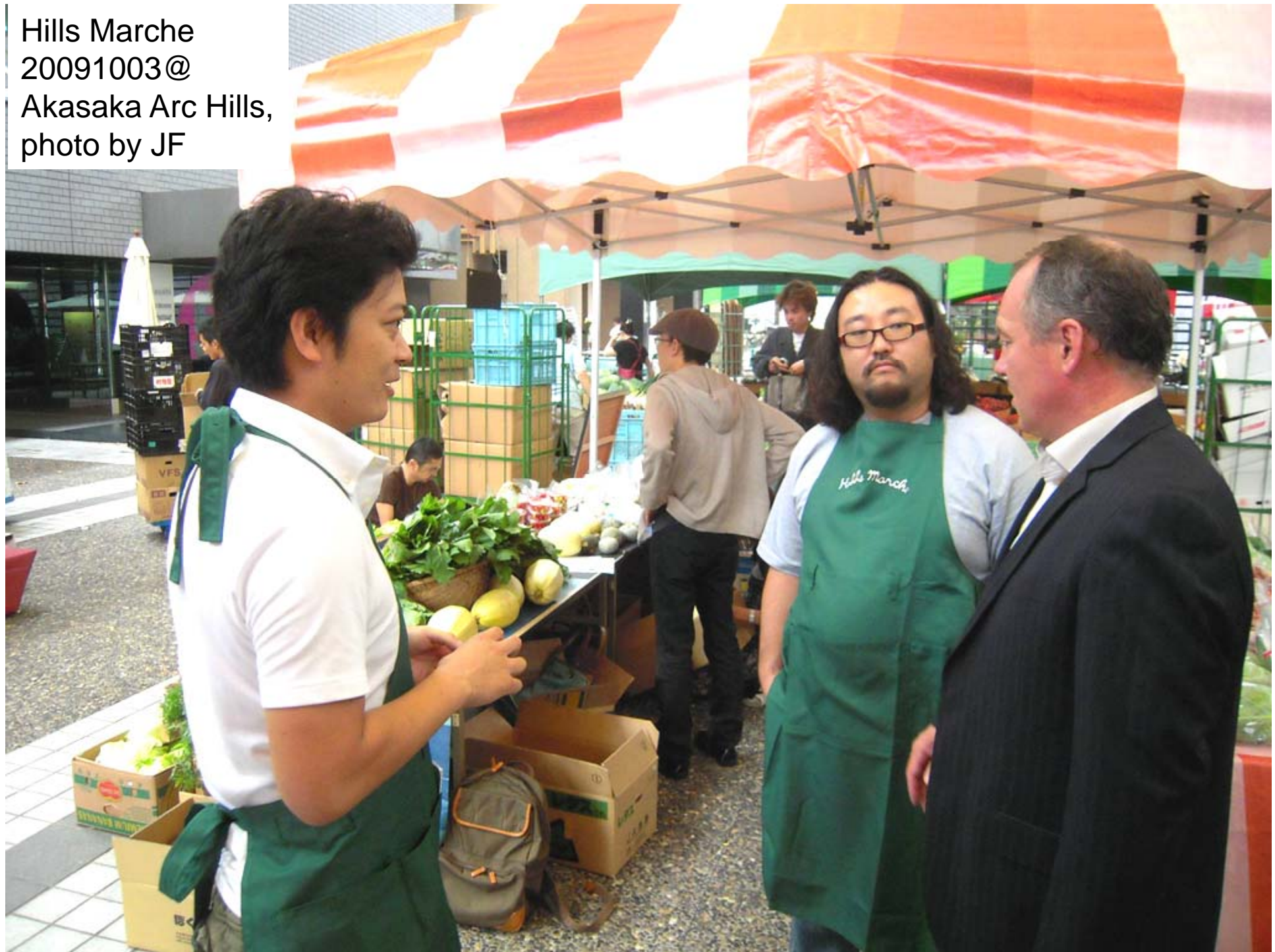
Hills Marche 20091003@ Akasaka Arc Hills