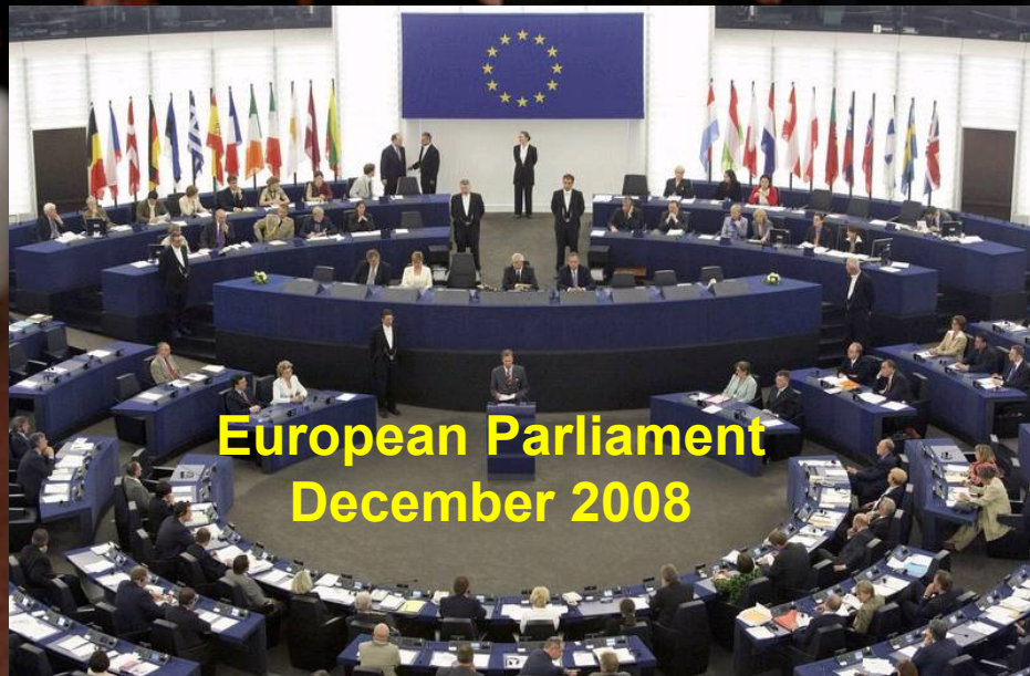
European Parliament December 2008