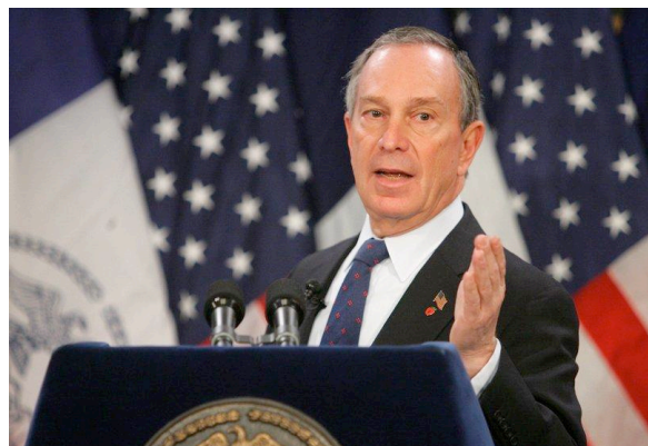
Michael Bloomberg Mayor of New York City, USA